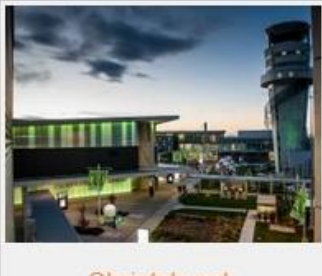
Christchurch International Airport Limited